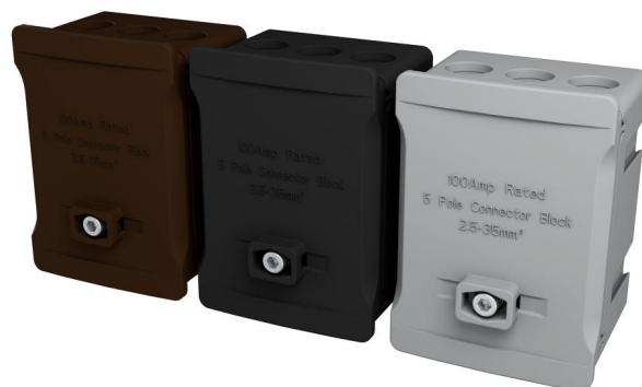
Optional 3 phase systems coloured mouldings