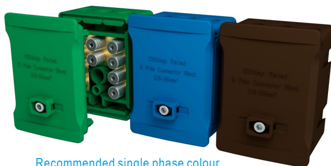
Recommended single phase colour